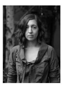
Playwright Emily Steel