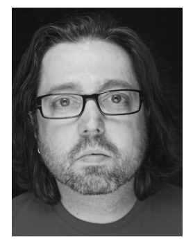
Composer & Sound Designer