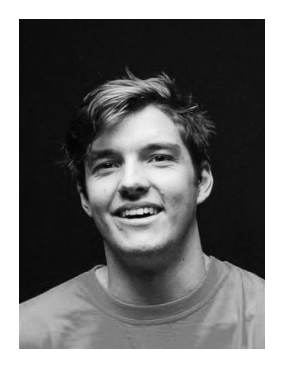
Mental Health Professional