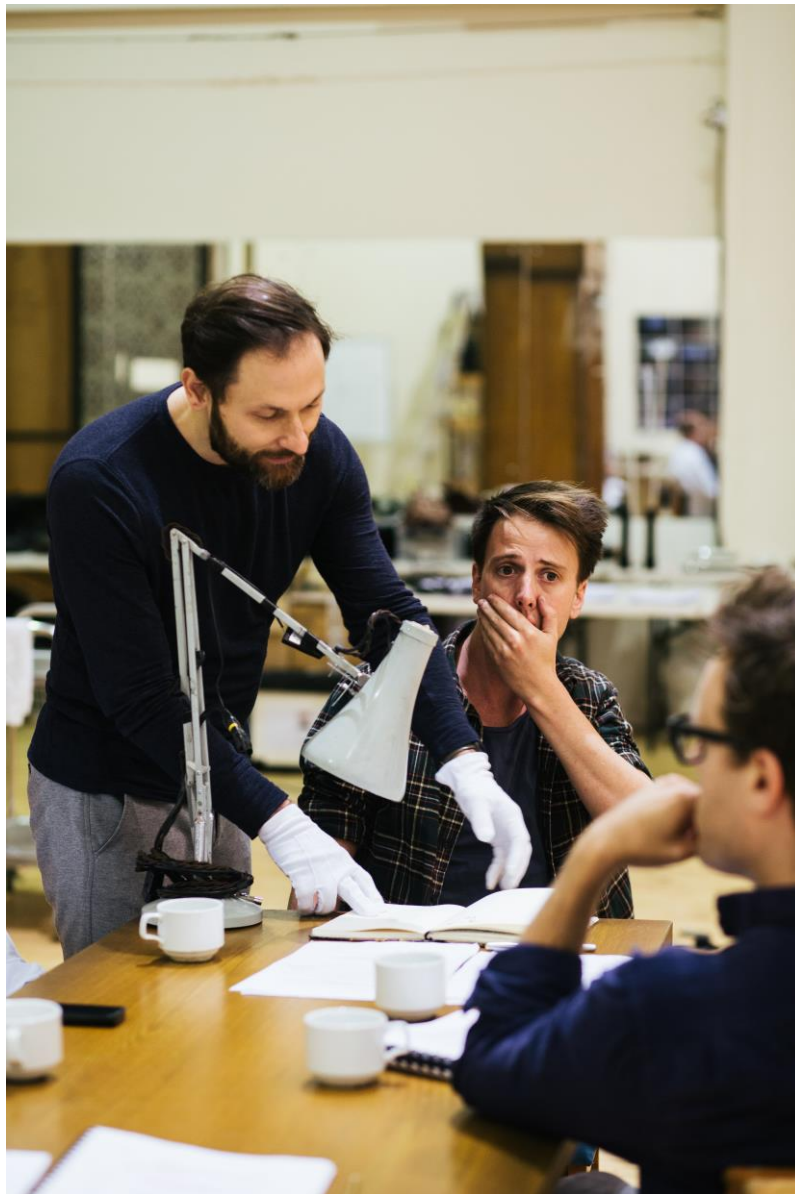
Rehearsals of 1984.

http://www.cityofadelaide.com.au/city-living/welcome-to-adelaide/city-safety/cctv/