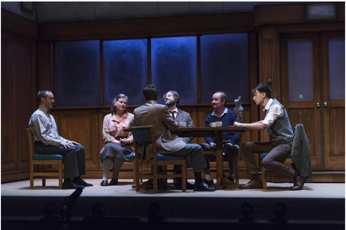
1984 Australian cast on stage

http://www.sparknotes.com/lit/1984/facts.html