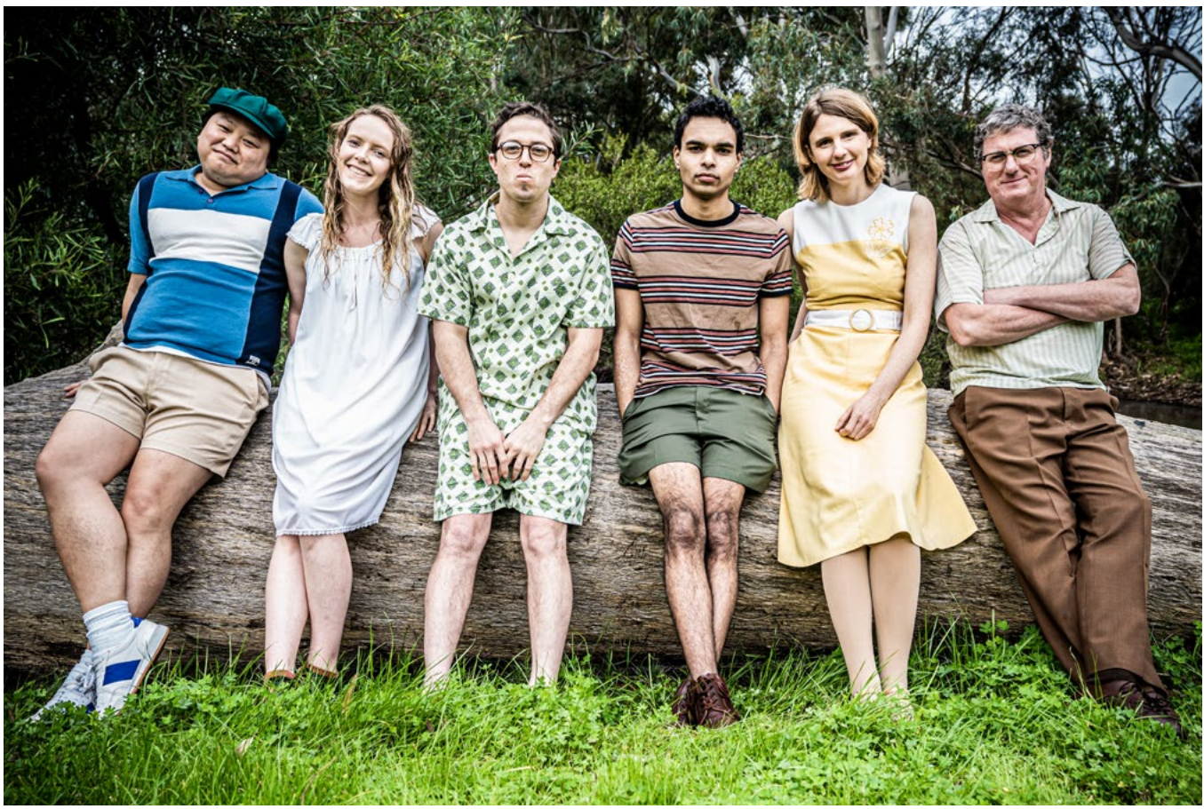
THE CAST OF JASPER JONES.