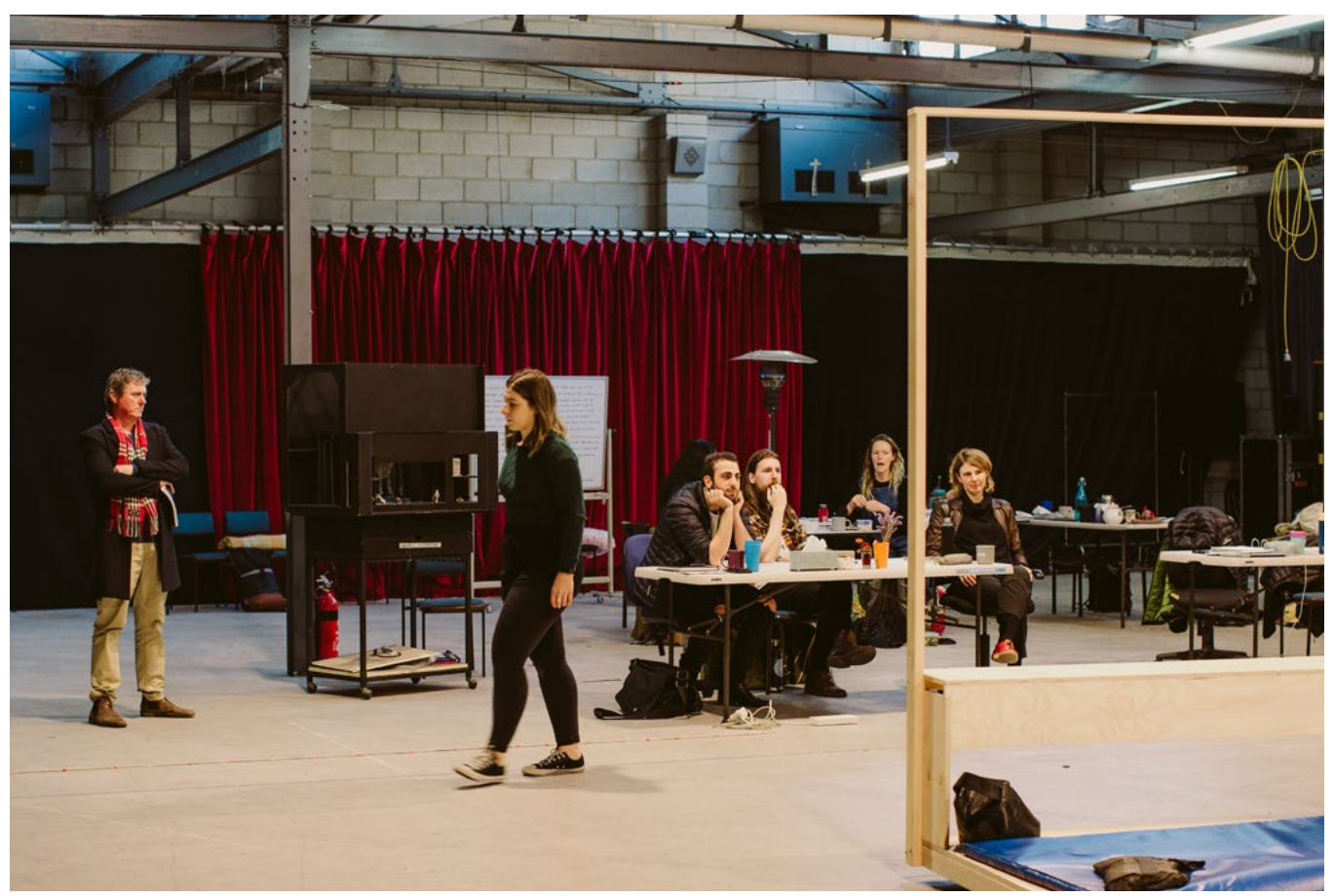
CAST AND CREATIVES FROM JASPER JONES IN THE STATE THEATRE COMPANY REHEARSAL ROOM.