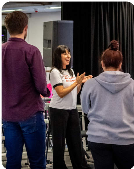
Above: Musical theatre workshop

For more information about State Theatre Company South Australia's full 2024 season and how to subscribe, please visit statetheatrecompany.com.au