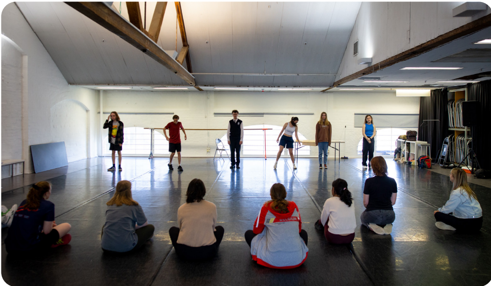
Above: Winter School students