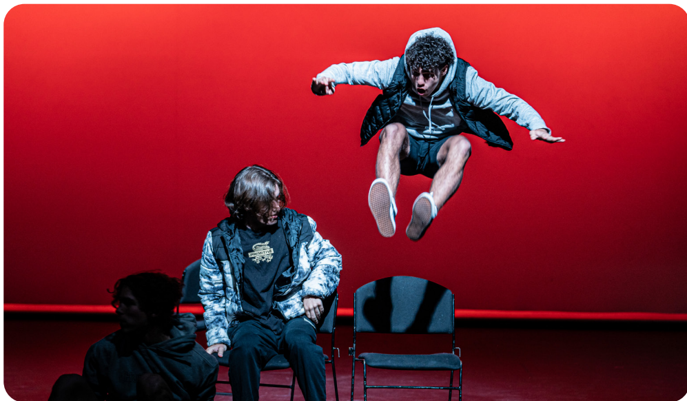
Above: Students performing for the Flinders University Young Theatre Makers Award