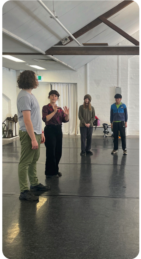
Above: Winter School students

For more information, please contact our Education Program Manager on (08) 8415 5307 or email education@statetheatrecompany.com.au