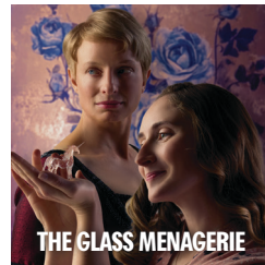
THE GLASS MENAGERIE