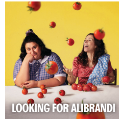
LOOKING FOR ALIBRANDI