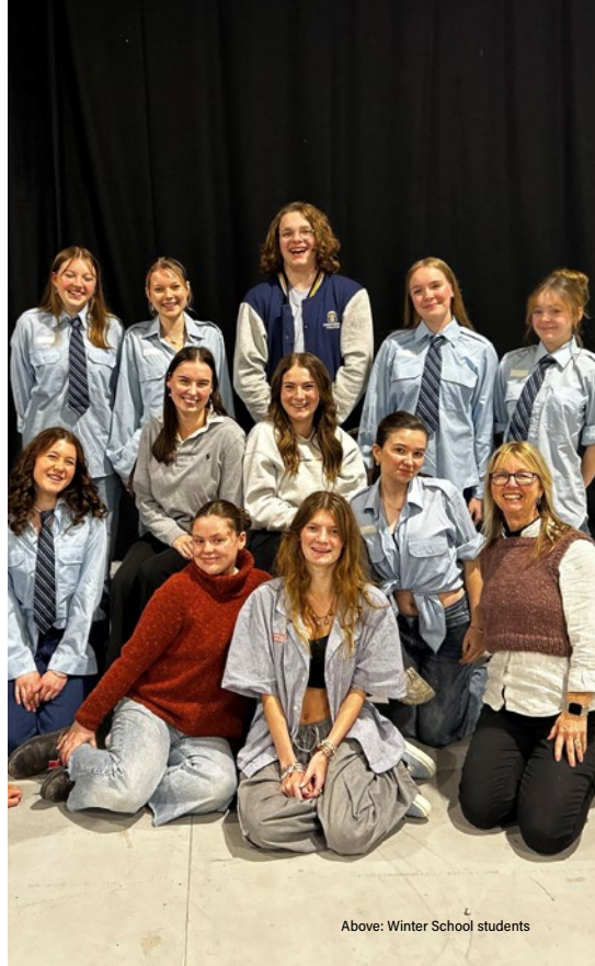
Above: Winter School students